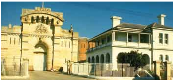
Bathurst Correctional Centre

Justice Health has its origins in the first European settlement established in Australia in 1788. The health of the penal colony was managed by the Colonial Medical Service, which remained responsible for the medical supervision of convicts until 1836. Subsequently the Prisons Act gave prison governors direct control over healthcare provided to inmates. This continued until 1968 when control of the Prison Medical Service was transferred to the NSW Department of Health.