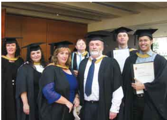
Masters in Forensic Mental Health Graduates – 2009

OUR JUSTICE HEALTH HAS OVER 1,200 EMPLOYEES WORKING AT LOCATIONS ACROSS METROPOLITAN, REGIONAL AND REMOTE NEW SOUTH WALES