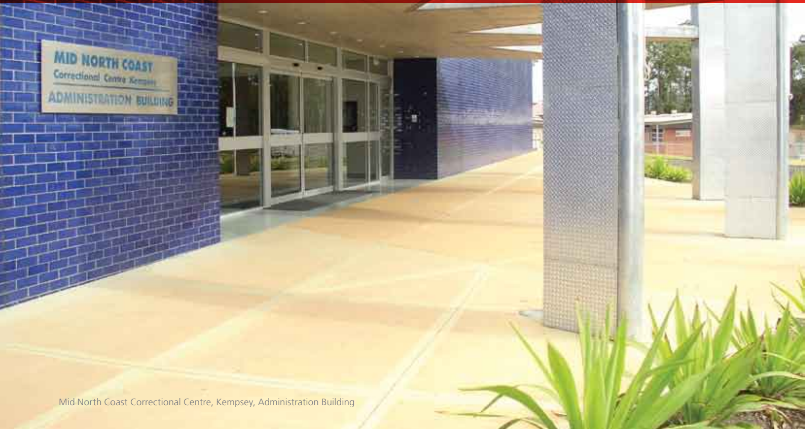
Mid North Coast Correctional Centre, Kempsey, Administration Building

Justice Health cares for 30,950 (June 2009) inmates and detainees annually and is responsible for providing health services in over 80 locations in metropolitan and regional New South Wales.