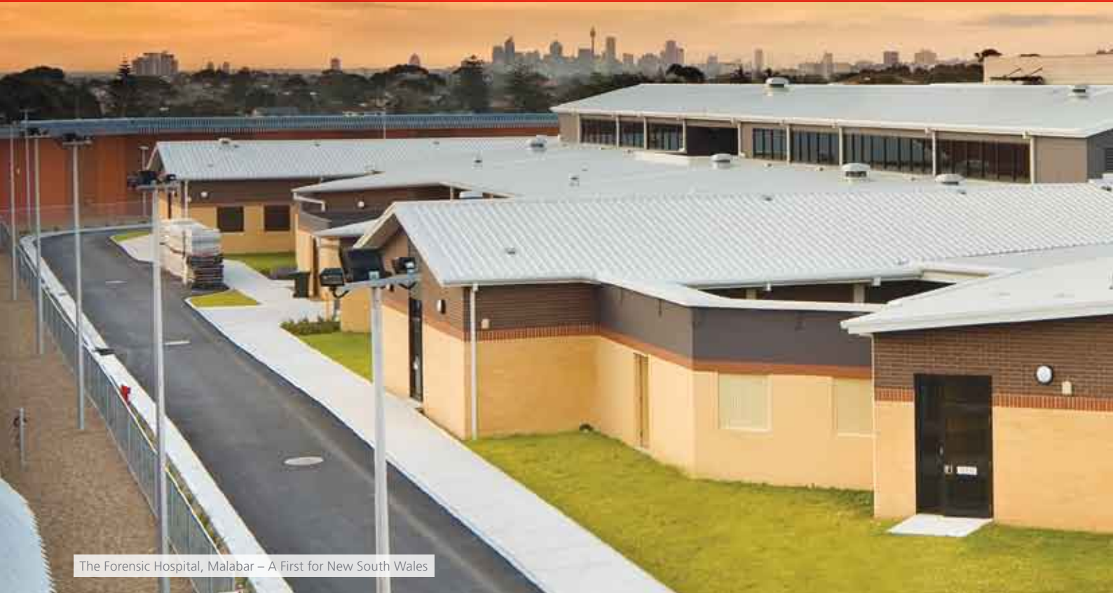
The Forensic Hospital, Malabar – A First for New South Wales