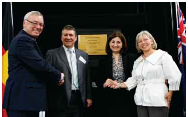
The Official Launch of The Forensic Hospital, Malabar