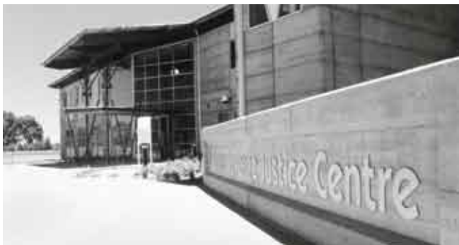
Orana Juvenile Justice Centre

Each year there are over 150,000 movements of adult inmates between correctional centres and court complexes.