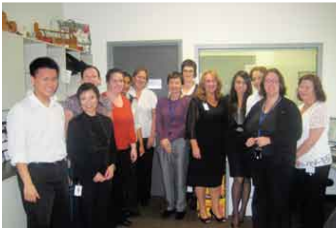
The Pharmacy Department of Justice Health