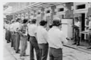
Parade in the 1970s