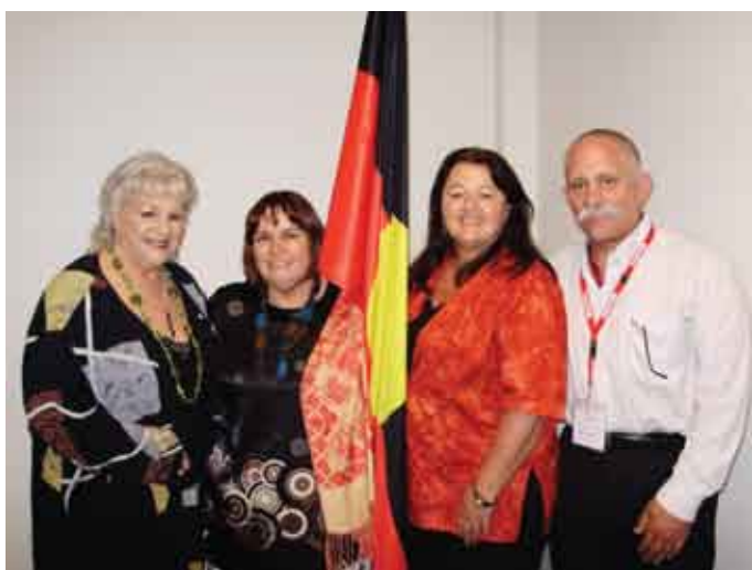
The Aboriginal Health Unit of Justice Health