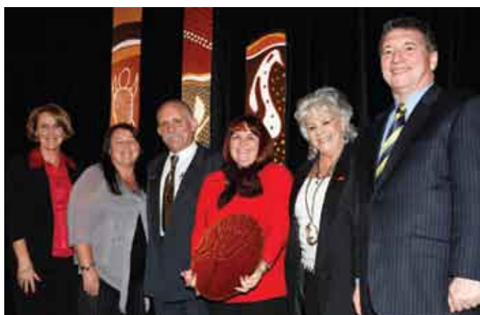
2009 Aboriginal Health Awards